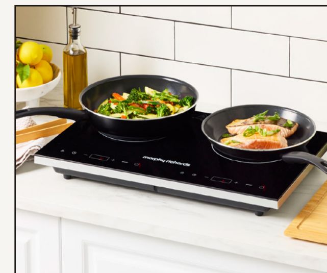
Powerful 2200W Cooking With Boost