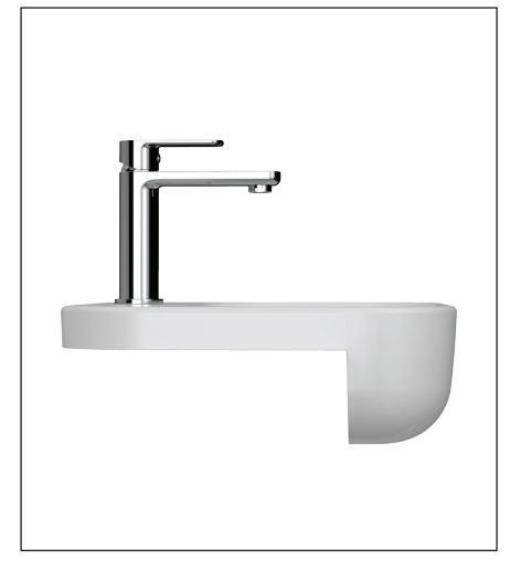
Tapware shown not included.