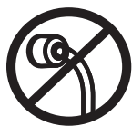
FIG 1. STOP DO NOT INSTALL HOSE THIS WAY

For commercial, industrial or parahealth use; ask your store consultant for correct shower selection.